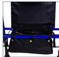
Water-Resistant Nylon Pouch

The stylish ProBasics Deluxe Height Adjustable Aluminum Rollator features a unique design allowing the user to adjust the seat and handle height to their specifications for maximum comfort and universal fit (adjusts from junior to adult size with one rollator). This lightweight rollator feature easy-to-operate ergonomic hand brakes and 8-inch wheels for great maneuverability and stability. A seamless padded flip-up seat with zipper compartment and large nylon storage pouch keep belongings private and protected.