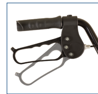
Easy-to-Operate Ergonomic Hand Brakes