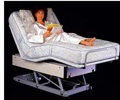
The Deluxe Adjustable Bed

Step 11: Attach retainer bar and half rails. Place mattress on top.