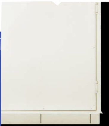
▲ Top landing gate with mechanical interlock that releases only when platform reaches the top of landing