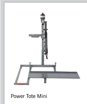
Power Tote Mini