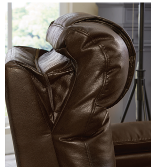
Adjustable Headrest & Lumbar