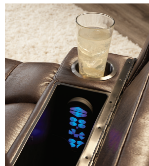
Right Arm: Cup Holder & Storage Compartment

The Rhea comes standard with the following comfort and convenience features: